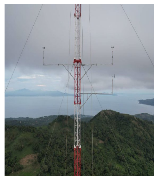
Anemometers and Wind Vanes at different levels (120, 100, 80, 60 meters)