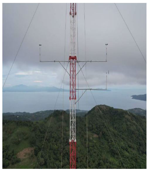
Anemometers and Wind Vanes at different levels (120, 100, 80, 60 meters)